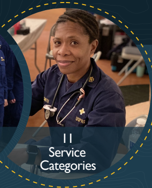
11 Service Categories