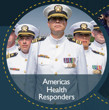
Americas Health Responders

The USPHS Commissioned Corps is one of the eight uniformed services and is composed of highly skilled public health service officers ready to deploy at a moment's notice.