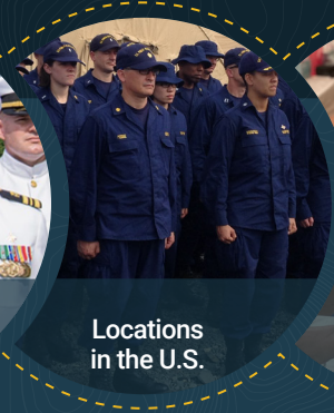
Locations in the U.S.