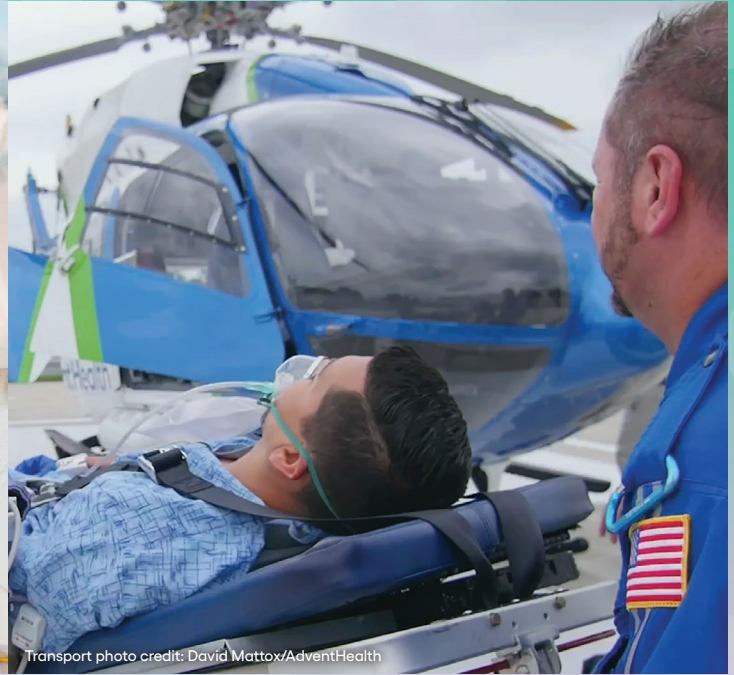
Transport

Critical care transport • Airway management • Ventilator management